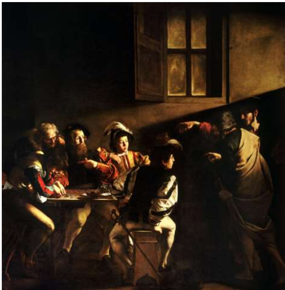
The Calling of St. Matthew by Caravaggio

The motto of Pope Francis ( Miserando atque Eligendo ) is taken from a passage from the venerable Bede, on the Feast of Matthew: Jesus therefore sees the tax collector, and since he sees by having mercy and by choosing, he says to him, 'follow me'.